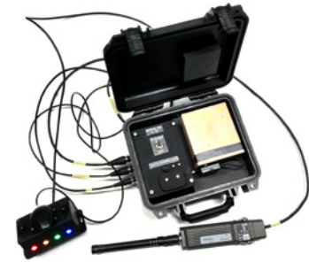
Pointer Tracker + Laser Receiver + Radio Link

Combat-ready crews need an effective tactical training system to develop defensive skills against close-in FIAC attacks and swarm threats. QinetiQ has developed POINTER-T to provide this training assurance.