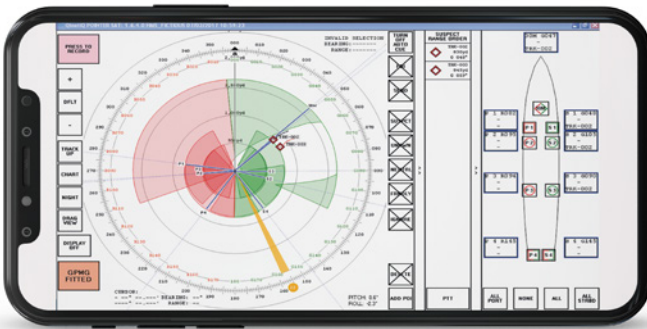
Commander's SA /C2 Terminal