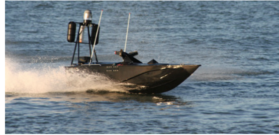
Sea Boat acting as target