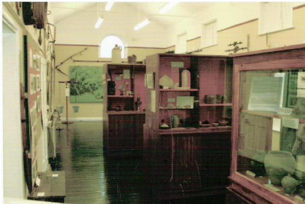
Part of the extensive display area

Displays include archaeological finds and study relating to the Romano-British Period and land reclamation during the Medieval Period on Foulness Island. Other displays show the island's flora and fauna and there is an extensive collection of tools and other artefacts from by-gone days, all donated by local inhabitants. The outcome is a diverse collection that shows a vivid picture of life over the ages on this unique and remote coastal habitat.